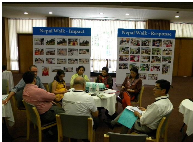
Group Discussion on WHS