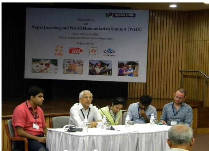
Panel discussion on Nepal Learning and Way Forward